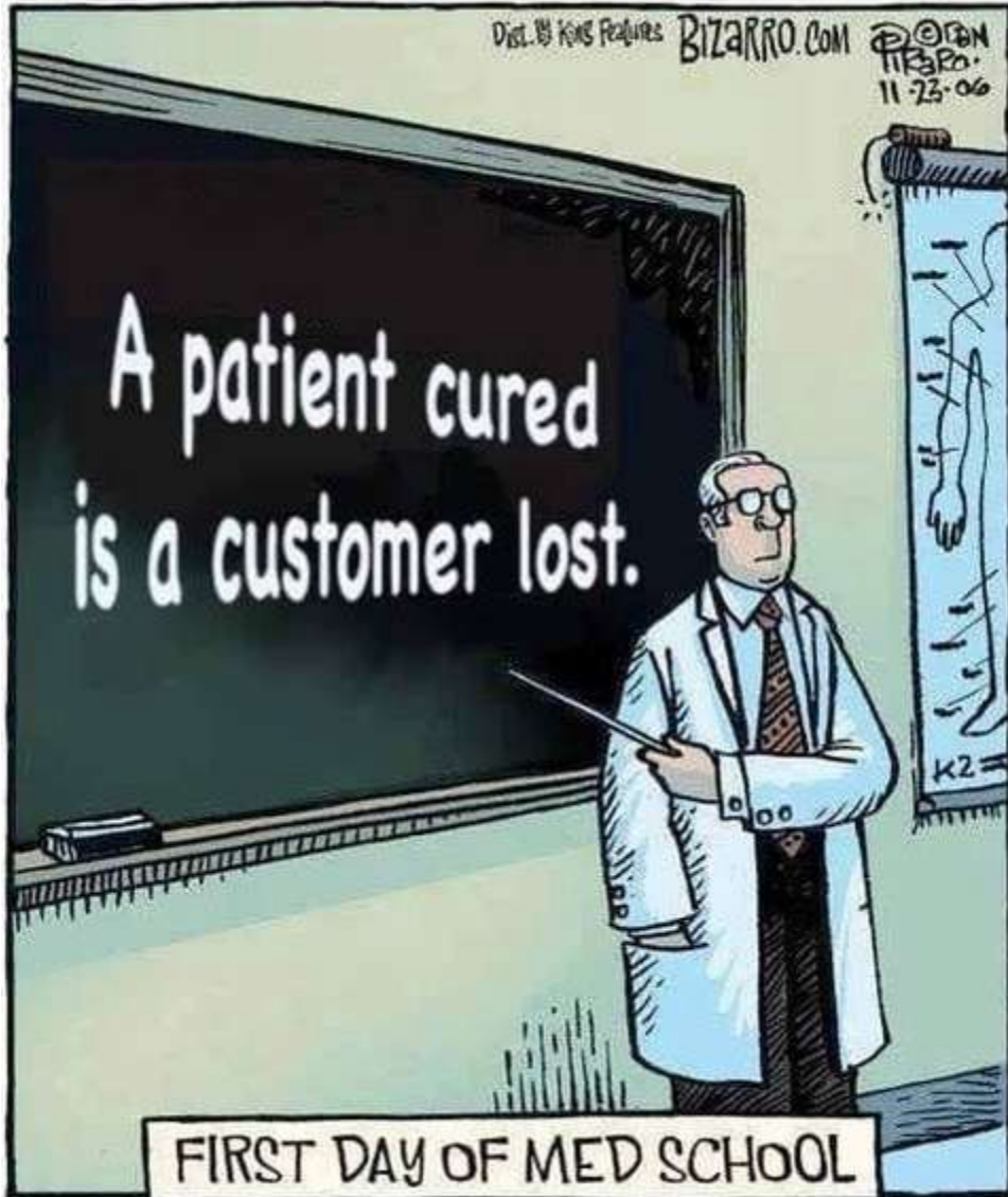
FIRST DAY OF MED SCHOOL

Dist. by KMS Features BIZARRO.COM © 2006 11-23-06